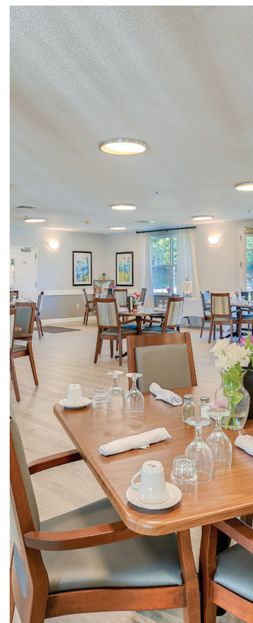
Photos shown from our portfolio of American House images, individual communities differ.

Every day offers the opportunity for something new — whether it's a movie in the cinema room or one of our many events.