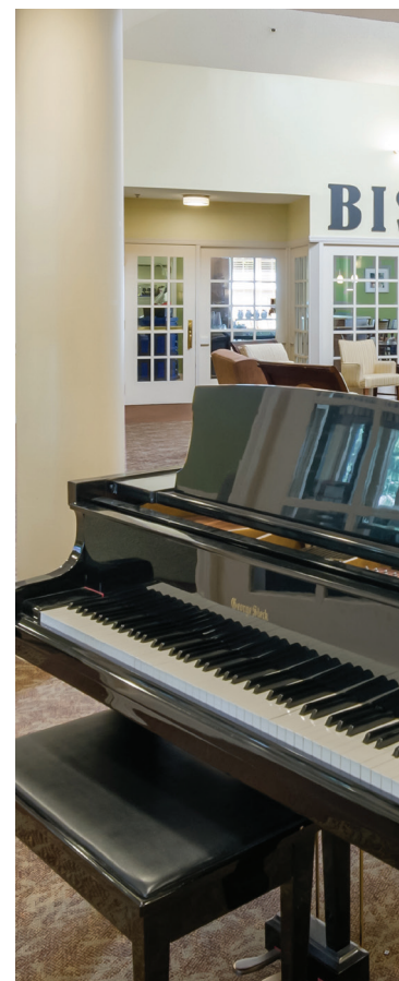
Photos shown from our portfolio of American House images, individual communities differ.

Our community offers relaxing spaces inside and out, with cozy seating around our grand piano, secure courtyards and a gazebo.