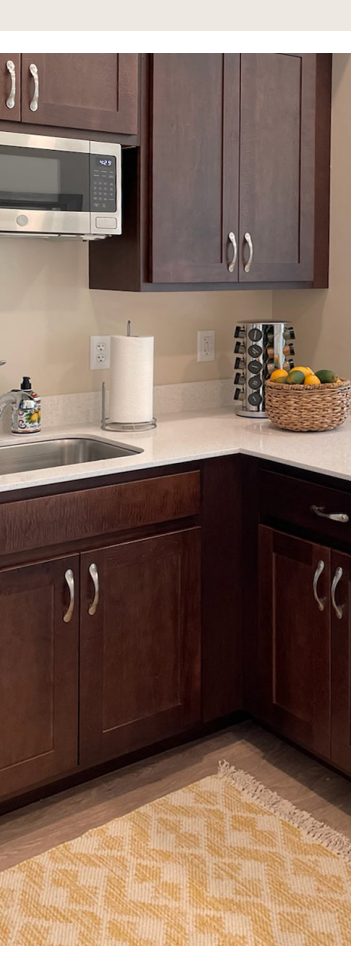
Photos shown from our portfolio of American House images, individual communities differ.

Our quiet community has a family atmosphere, with wooded grounds that invite peaceful reading under a tree or a relaxing stroll.