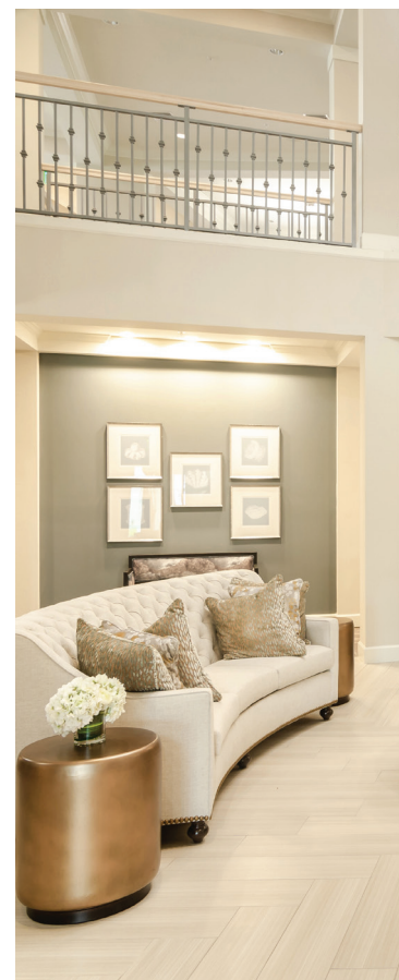
Photos shown from our portfolio of American House images, individual communities differ.

Our idyllic wooded community offers beautifully landscaped grounds, gardens and secure outdoor deck and walking path.