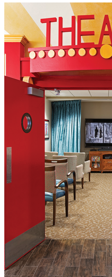
Photos shown from our portfolio of American House images, individual communities differ.

With beautiful spaces inside and out, residents relax in our courtyard, plant lovely gardens, and enjoy trivia contests and live musical guests.