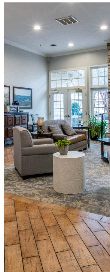
Photos shown from our portfolio of American House images, individual communities differ.

Our community offers relaxing spaces inside and out, with a landscaped courtyard and a fireplace in our comfortable lobby.